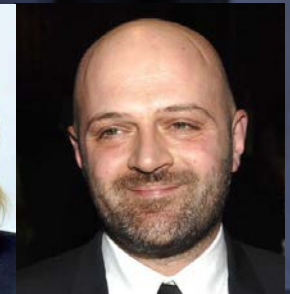
Hussein Chalayan Fashion Designer