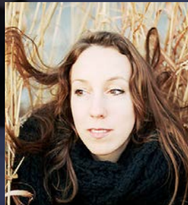
Iris van Herpen Fashion Tech Designer